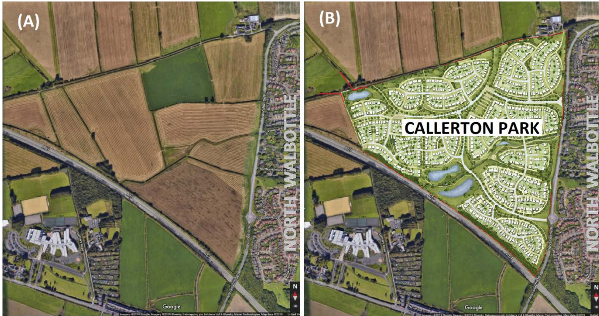
Figure 3: Gains and losses in countryside access: Aerial map of North Walbottle region before (A) and after (B) development of Callerton Park, Newcastle upon Tyne

Sources: Imagery and map data ©2019 Google, Bluesky plc, Infoterra Ltd. & Bluesky, Maxar Technologies. Callerton Park map © Pod Newcastle (2018)