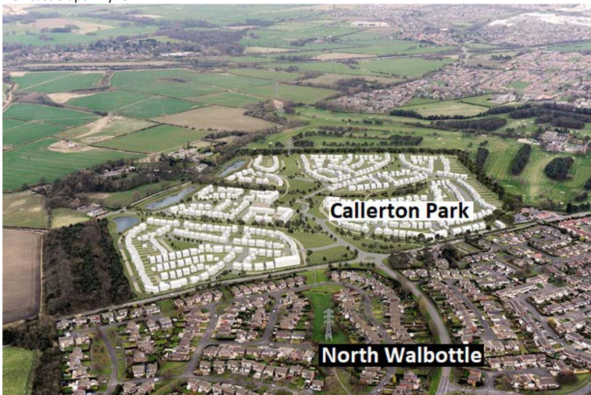
Figure 4: Gains and losses in countryside access: View of Callerton Park from North Walbottle, Newcastle upon Tyne